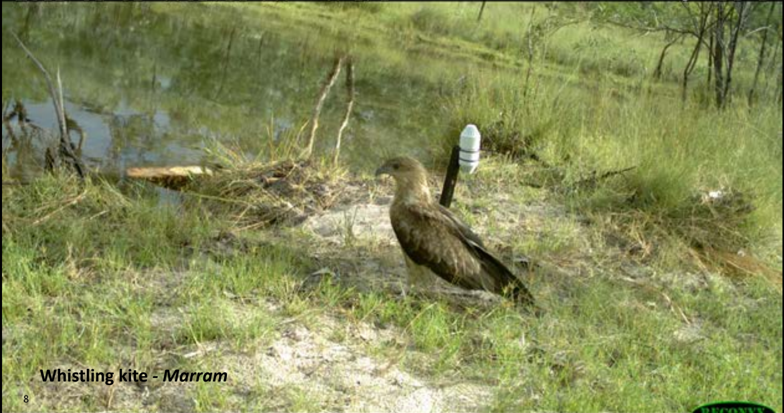
Whistling kite - Marram