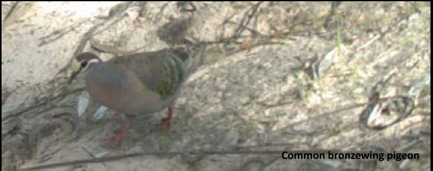
Common bronzewing pigeon

Species List: Crow - Wak Common bronzewing pigeon Agile wallaby - Kornobolo Dingo - Dalkken Camp dog Buffalo - Nganabbarru