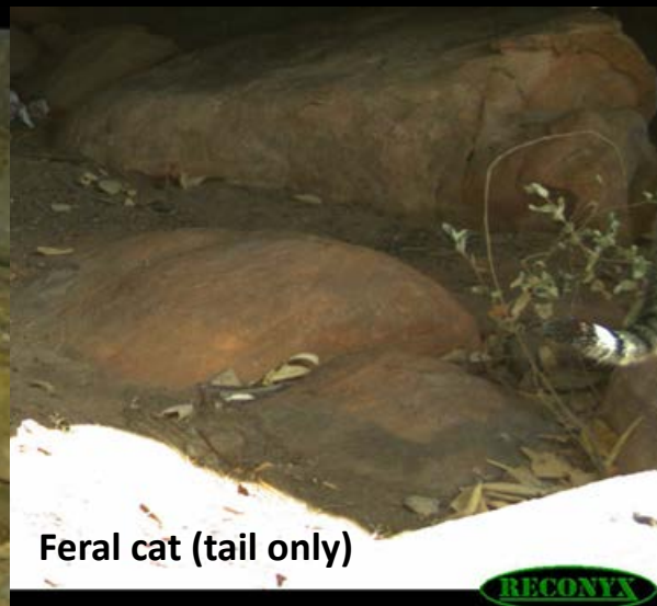
Feral cat (tail only)