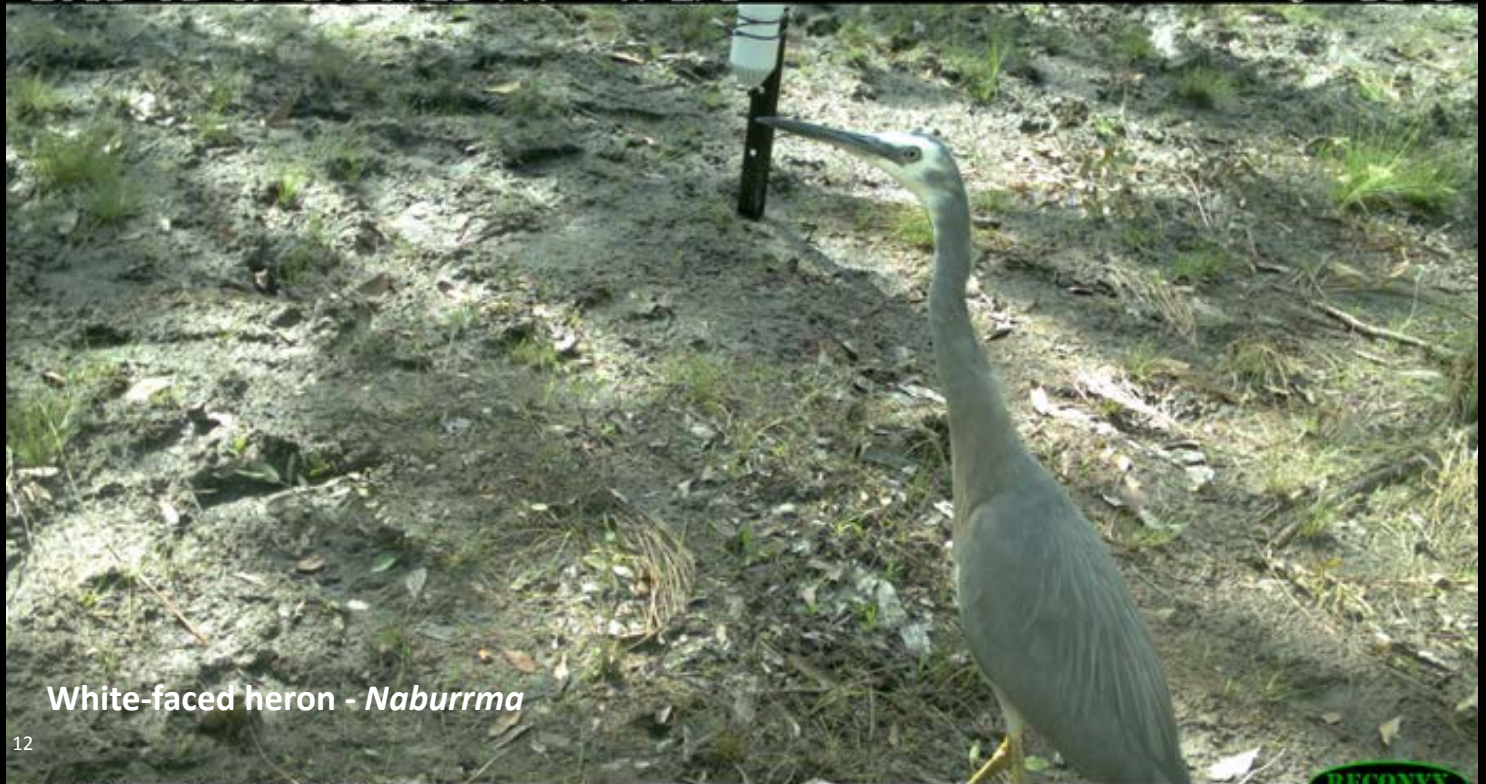
White-faced heron - Naburrrma