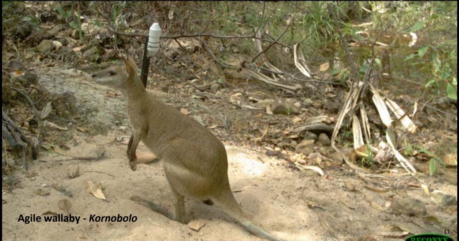
Agile wallaby - Kornobolo