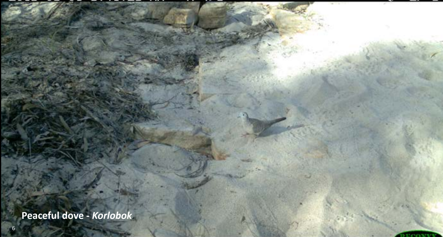
Peaceful dove - Korlobok