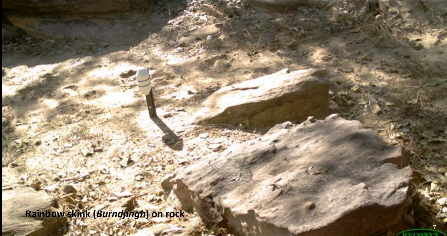
Rainbow skink ( Burndjingh ) on rock