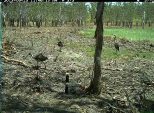
White-faced heron - Naburrrma and White ibis