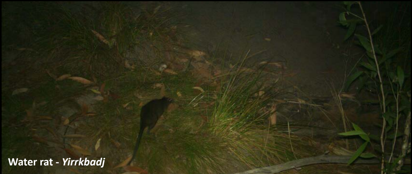
Water rat - Yirrkbadj