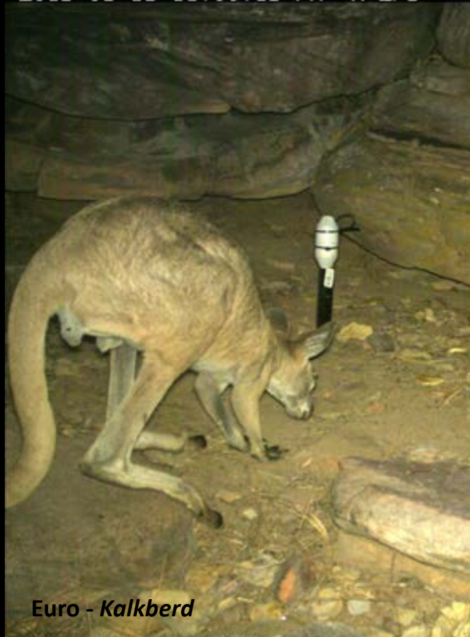
Euro - Kalkberd