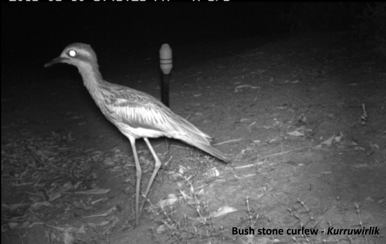
Bush stone curlew - Kurruwirlik