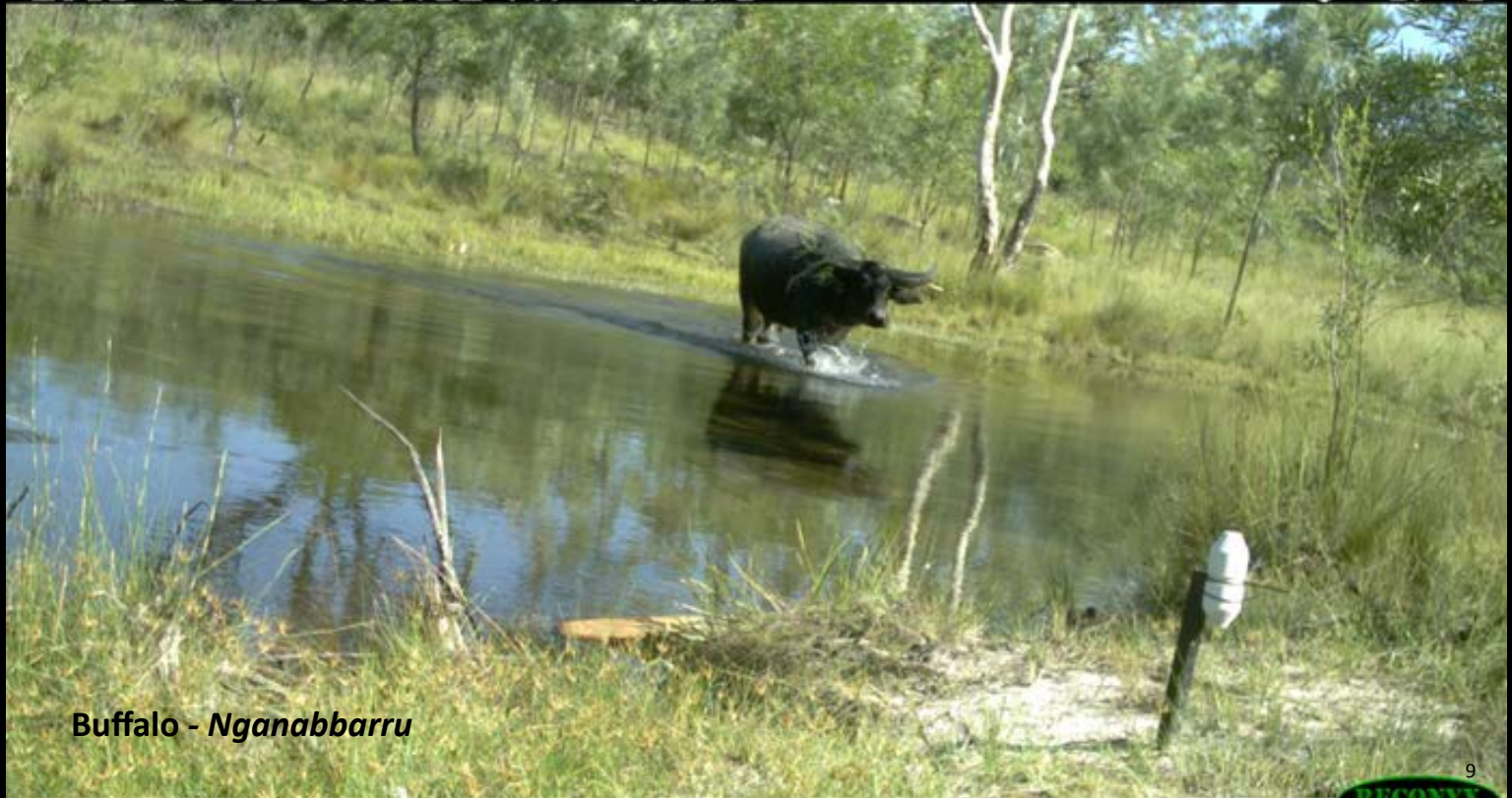
Buffalo - Nganabbarru