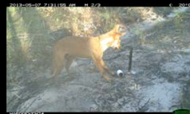
Dingo - Dalkken