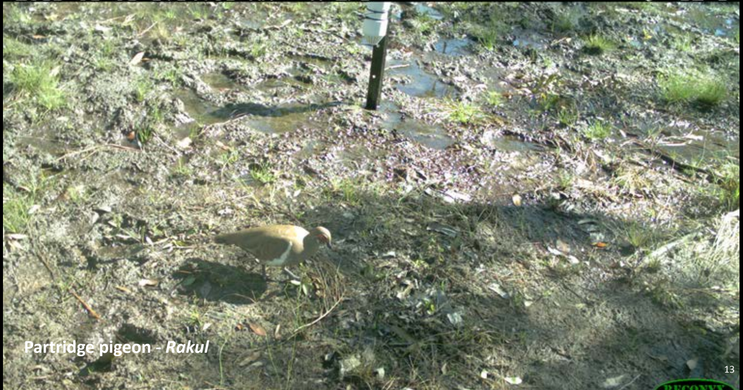
Partridge pigeon - Rakul