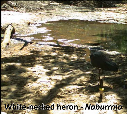
White-necked heron - Naburra