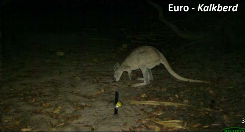
Euro - Kalkberd