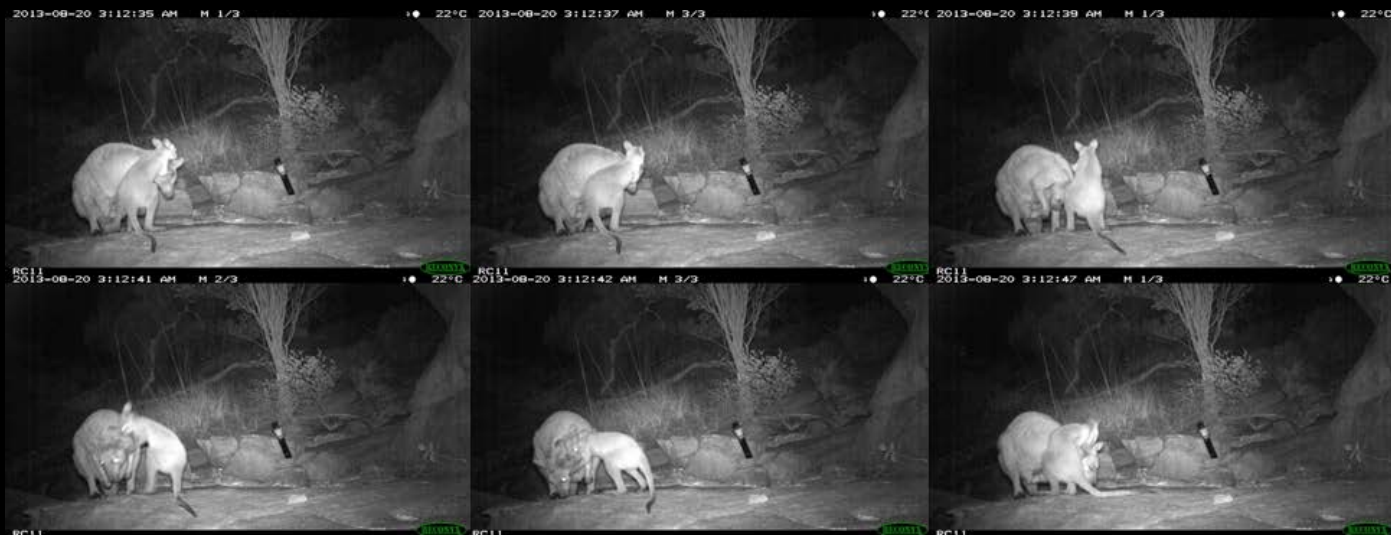
Black wallaroo (female) - Djukerre