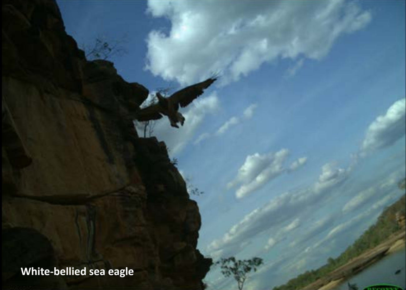
White-bellied sea eagle