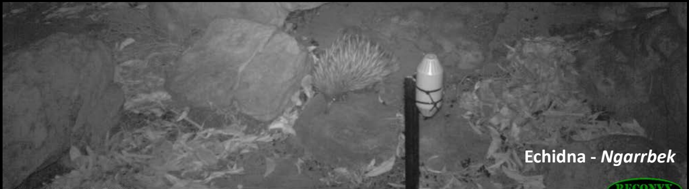
Echidna - Ngarrbek