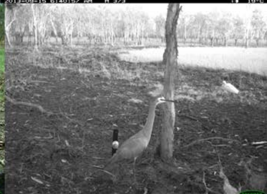
Straw-necked ibis and White-necked heron - Naburrrma