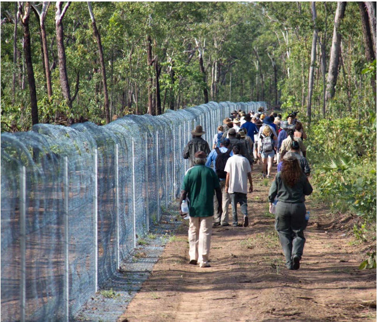
This cat enclosure fence was completed in Kakadu in late 2013.

The first substantial assessment of the incidence of disease in mammal assemblages of northern Australia indicates the presence of some pathogens that may have lethal or sub-lethal impacts on native mammals, but there is uncertainty around their role in the current decline.