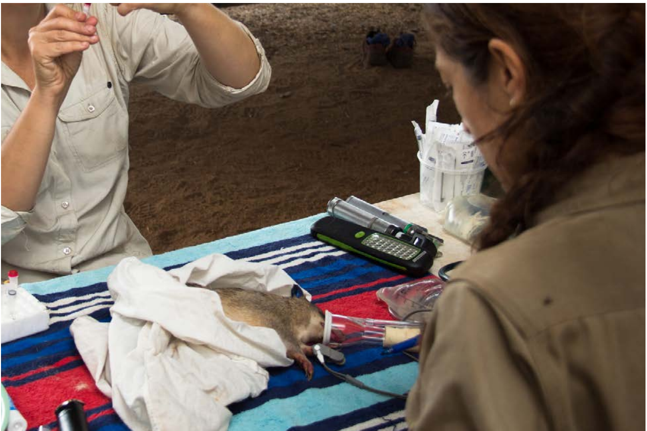
Researchers conduct a health check on a northern brown bandicoot.

There are constraints not only on research but also on the subsequent application of research outcomes to develop effective management responses. There may be few options for the cost-efficient control of feral cats, disease or cane toads; and a preferred fire regime (such as a significant increase in the extent of long-unburnt habitat) for at least some declining mammal species may now be almost impossible to establish.