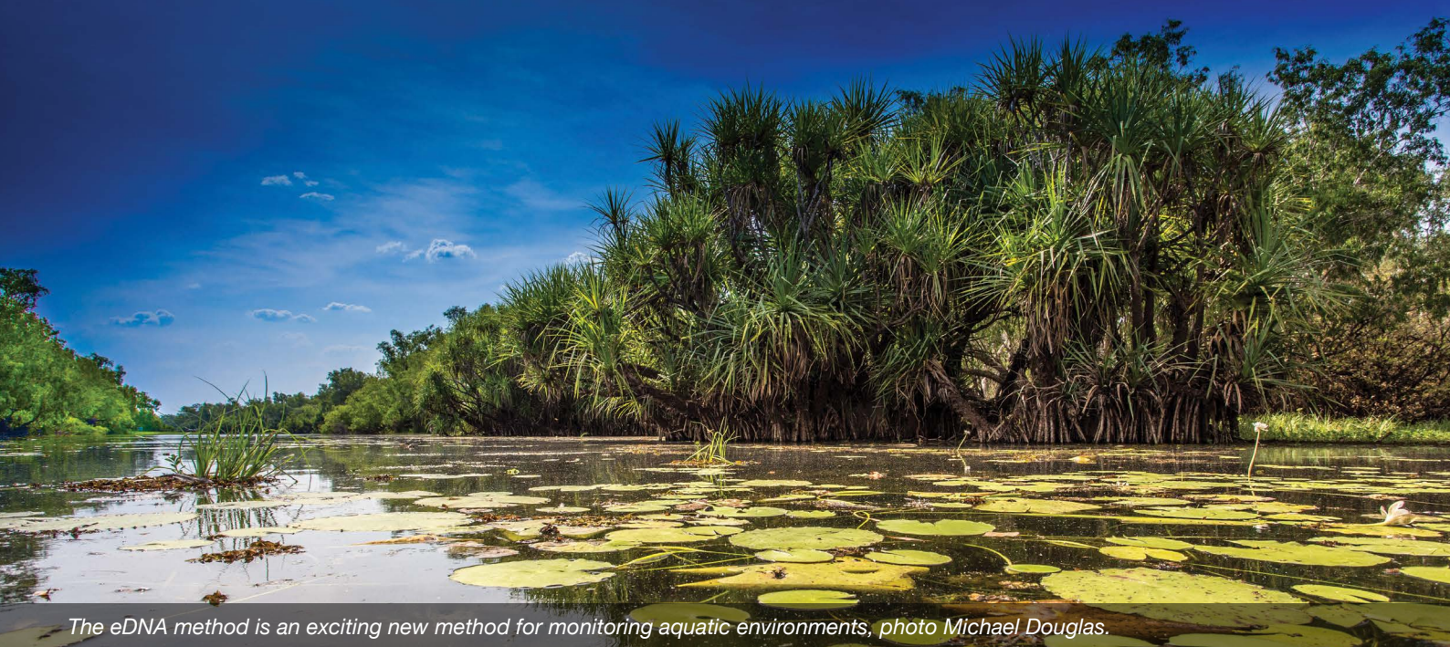
The eDNA method is an exciting new method for monitoring aquatic environments