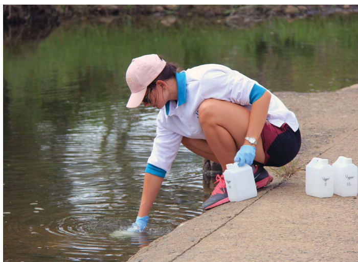
Surveying for aquatic species may be as simple as collecting a water sample.

In northern Australia, traditional techniques used to detect aquatic species can be difficult, labour-intensive and expensive due to factors such as remote locations, expansive geographic regions, limited and variable site access, and hazards such as crocodiles. To support sustainable development in the north, we need to better understand and keep track of the health of our rivers, creeks and waterholes and the plants and animals that live in them. A method that allows managers and researchers to overcome many of these challenges would therefore be greatly beneficial.