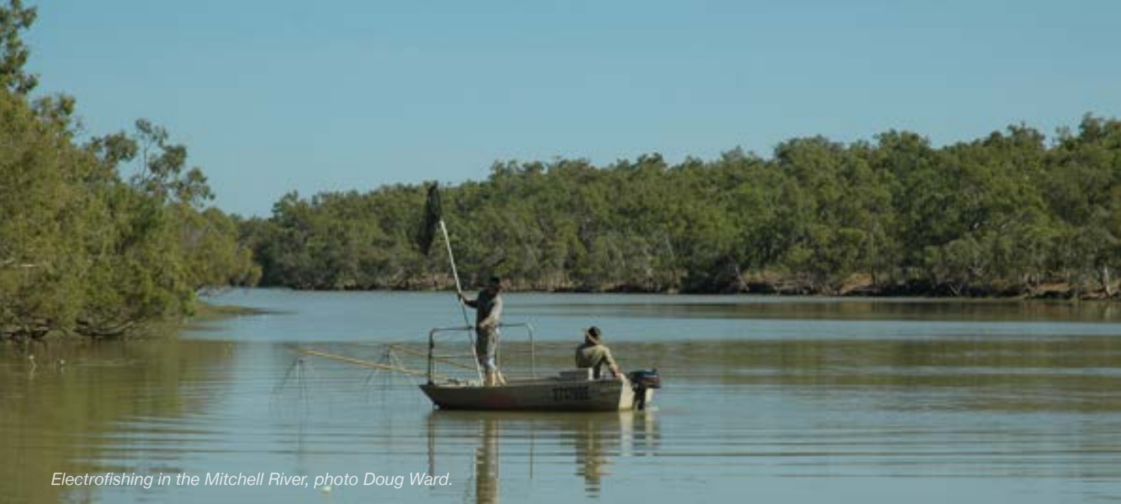
Electrofishing in the Mitchell River