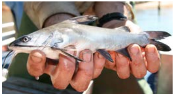
Researcher surveying fish