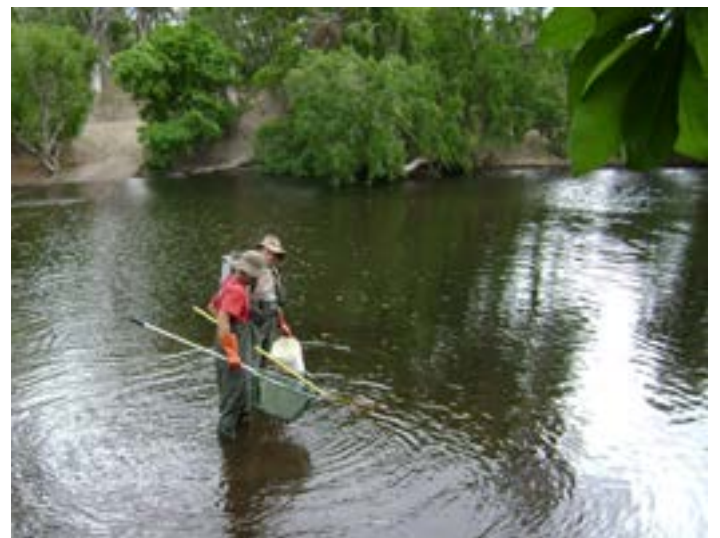
Electrofishing in the Mitchell River