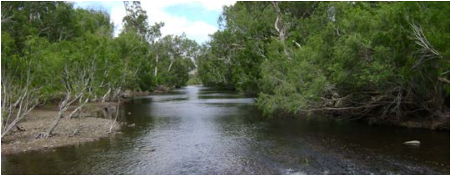
Mitchell River