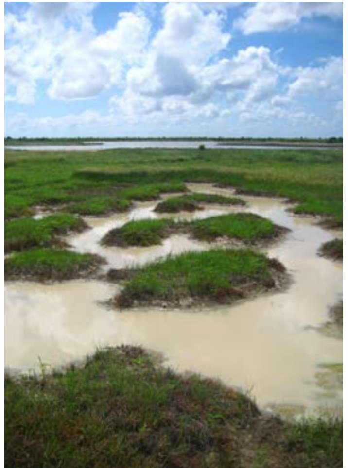
Gulf floodplain, photo Michele Burford.