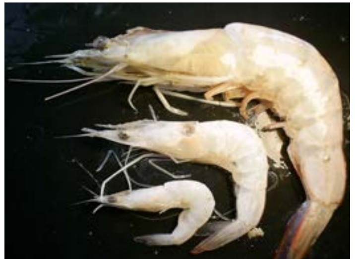
The researchers will use banana prawns, which have a well understood life cycle, as an indicator species, photo Matthew Whittle.