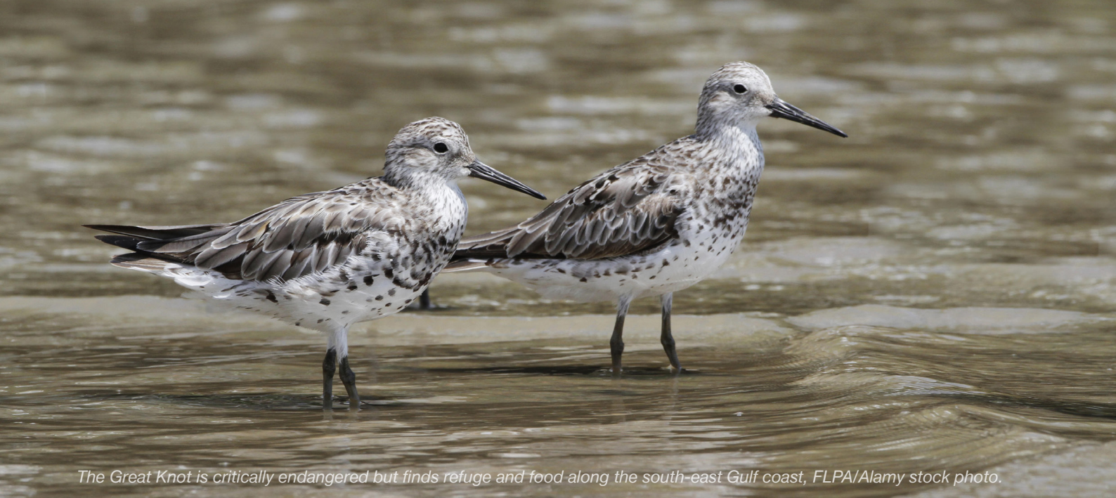
The Great Knot is critically endangered but finds refuge and food along the south-east Gulf coast, FLPA/Alamy stock photo.