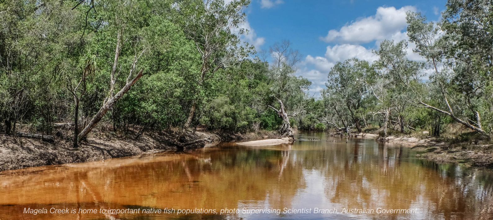
Magela Creek is home to important native fish populations