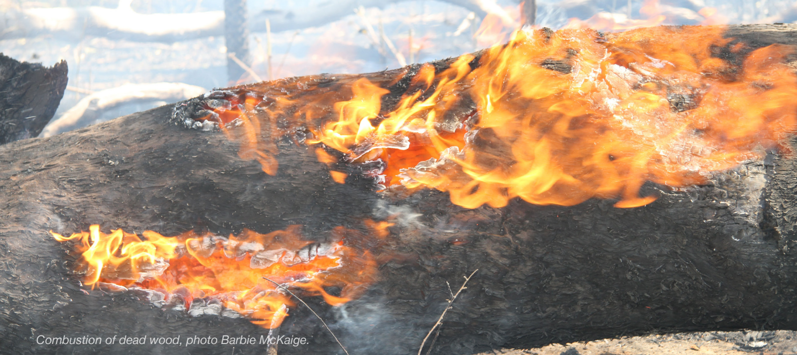
Combustion of dead wood, photo Barbie McKaige.