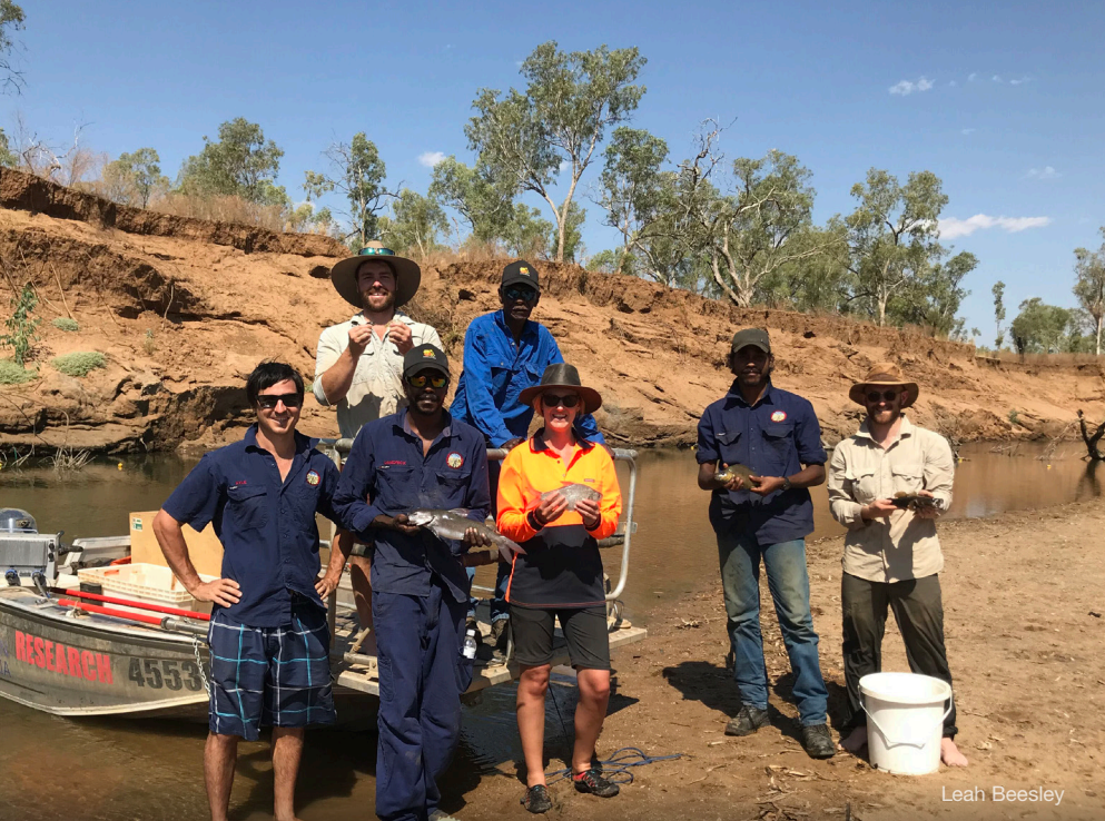
Gooniyandi Rangers working with the NESP fish team.