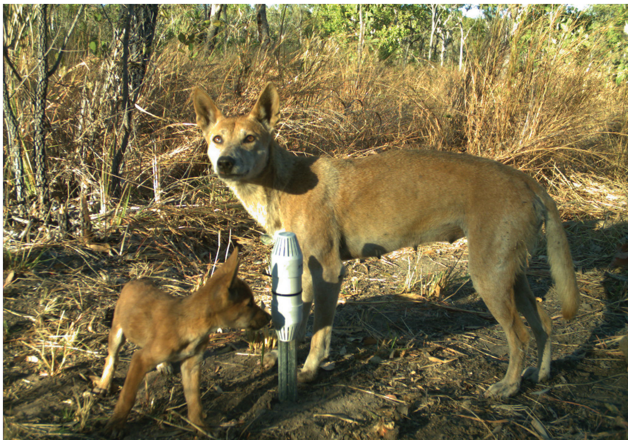
Female dingo and pup recorded by a camera at one of the study sites in the Top End of the Northern Territory.

We found that large offshore islands (i.e. the Tiwi Islands and Groote Eylandt) are critical refuges for northern Australia's mammals, as these areas contain complex and productive habitat and low numbers of feral cats and dingoes. These islands are essential to the protection of northern Australia's native mammals. Reducing the number of feral livestock and improving fire management on these islands is a management priority to save our mammals.