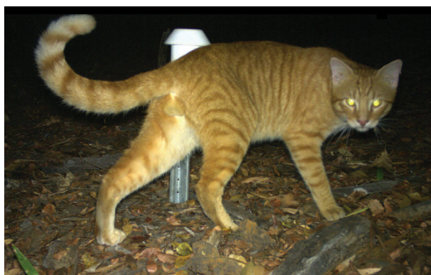
A feral cat recorded by a camera at one of the study sites in the Top End of the Northern Territory.

However, increases in the frequency and severity of fire, and overgrazing by cattle and feral livestock have greatly reduced habitat complexity across northern Australia since the arrival of Europeans. Frequent, hot fires remove ground cover and reduce the shrub layer. Lower-rainfall areas, which already had a more open and simple habitat structure, have been especially affected by these changes in fire. Heavy grazing by cattle and feral livestock further removes the grassy understorey.