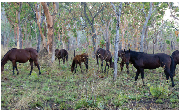
Feral horses in Kakadu National Park.

and therefore provide a useful starting point for mammal conservation. Identified mainland sites include: