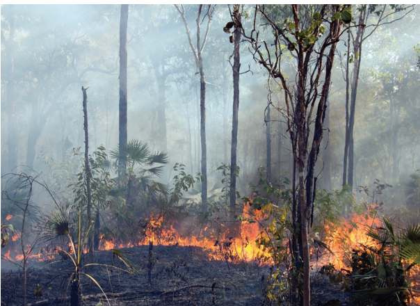
A low-intensity early dry-season burn in tropical savanna.

We identified a number of sites in the Top End that support a high number of mammal species