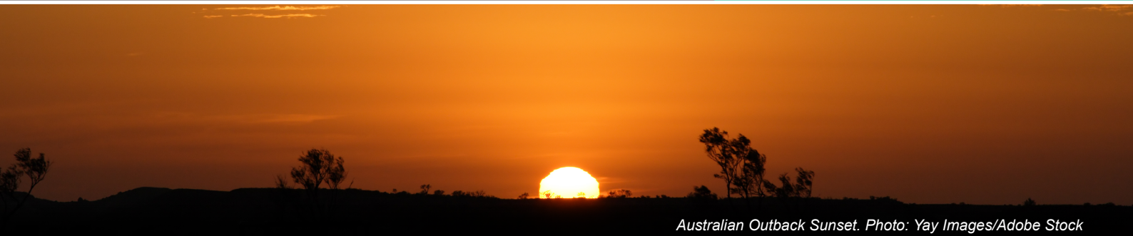
Australian Outback Sunset.

Project NIERN has been funded to explore a National Network which seeks to bring together Indigenous groups, researchers and governments to collaborate on environmental projects for better outcomes for Country and Well-being.