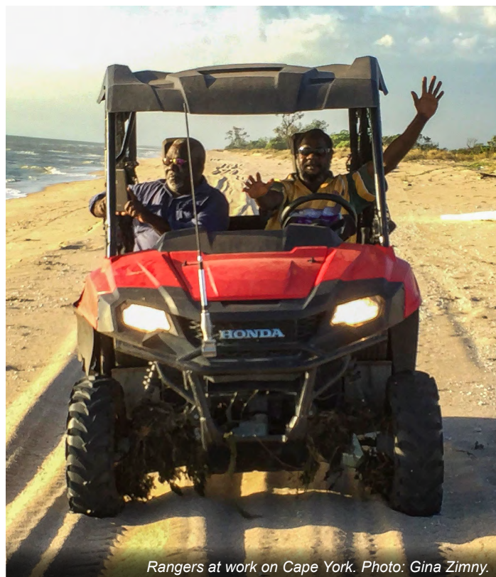
Rangers at work on Cape York.