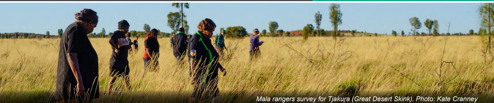
Mala rangers survey for Tjakura (Great Desert Skink).

The Indigenous Environmental Monitoring Platform project is developing a digital online service that will guide and support Indigenous practitioners on the protocols and technologies they can employ to best carry out and evaluate their on-Country monitoring and management programs.