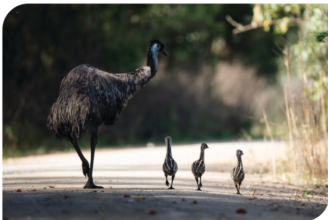
Male Nguruny with chicks.

As a megafaunal keystone species, Nguruny are known to travel up to 50 km in a day, dispersing seeds as they go. This ability to disperse seeds over such a large range is vital for many native plant species. Nguruny's digestion of seeds helps to break seed dormancy and cue germination.