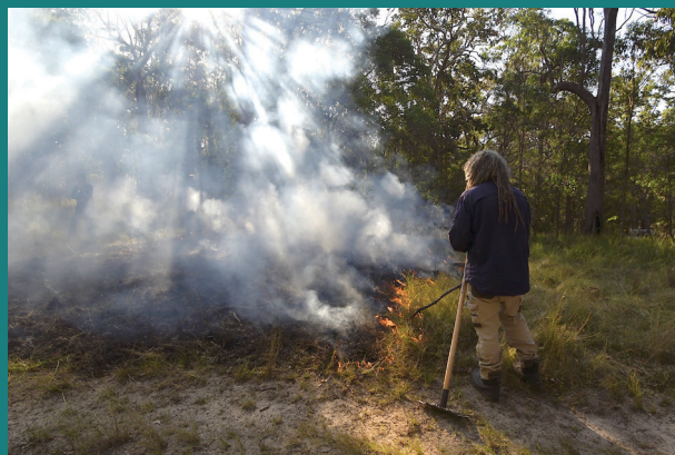
Marcus Ferguson performing a cultural burn on Bundjalung Country.

A Key Performance Indicator we should aim for is that we can once again eat Nguruny from Bundjalung Country.