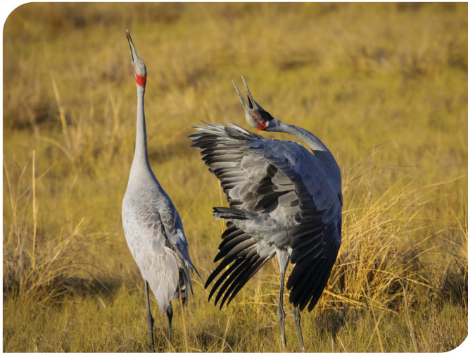
Courtship dance.