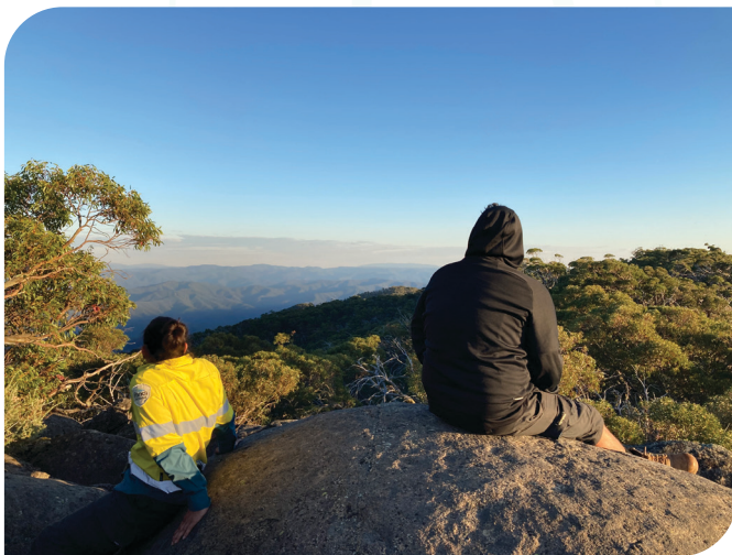
Taungurung Rangers undertaking on-Country Debbera monitoring at Geebarr (Mt Torbreck).