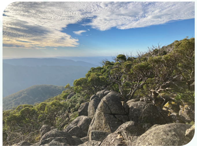
Views from Geebarr (Mt Torbeck), a Deberra aestivation site on Taungurung Country.

High elevation places in Taungurung Biik are described as Deberra Biik (Bogong moth Country), indicating the significance of this entity as a biocultural keystone for Country and culture. Deberra Biik is associated with deep cosmological knowledge and is a source of new ceremony. Deberra reminds us that Country, knowledge and kin cannot be separated, and the health and seasonal movements of entities within Country speak to us all.