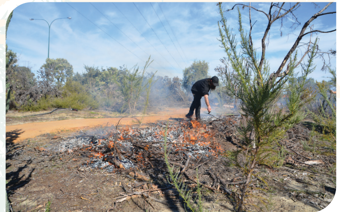
Cultural burn with Dakota Baker taking care of Moodjar.