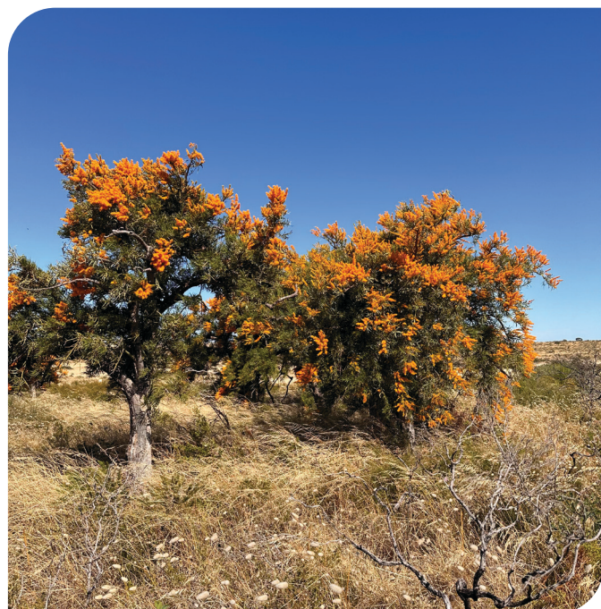
Moodjar, Breton Bay.

Studies have shown that Moodjar are resistant to Phytophthora Dieback and are therefore an important species used in restoration efforts in affected areas 1 .