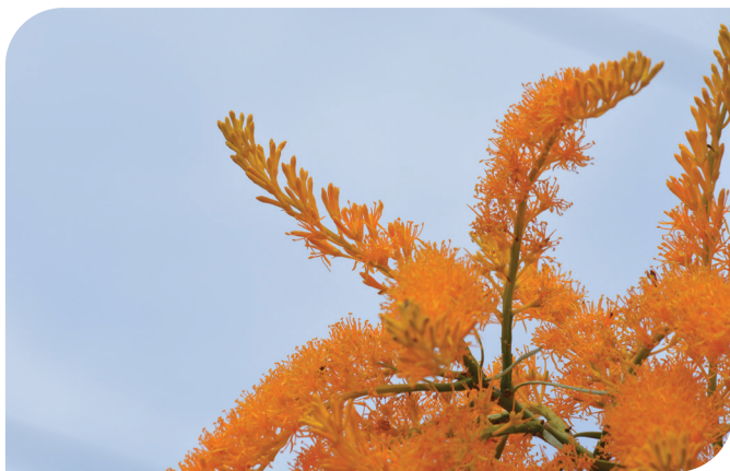
Moodjar flowers.

Uncle Simon Forrest, Whadjuk and Ballardong